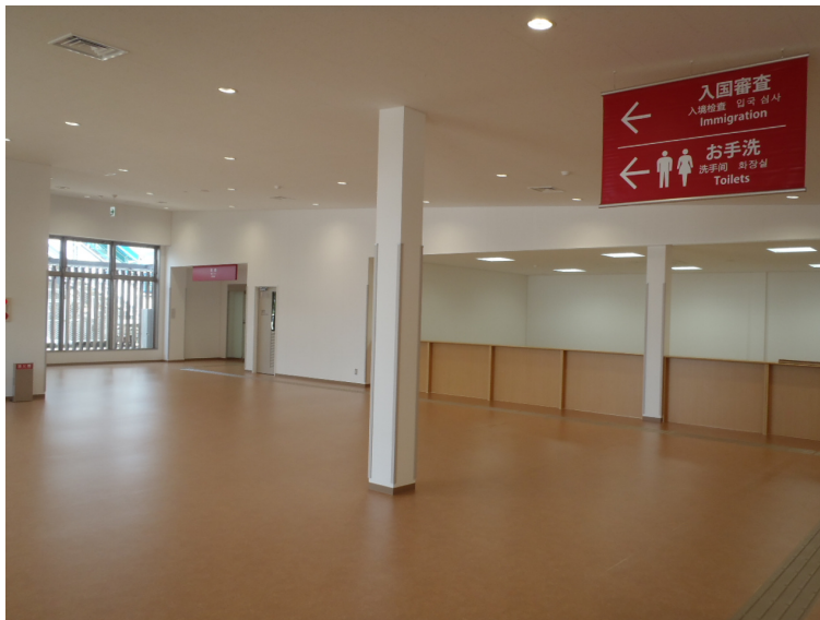
Entrance from the ship side